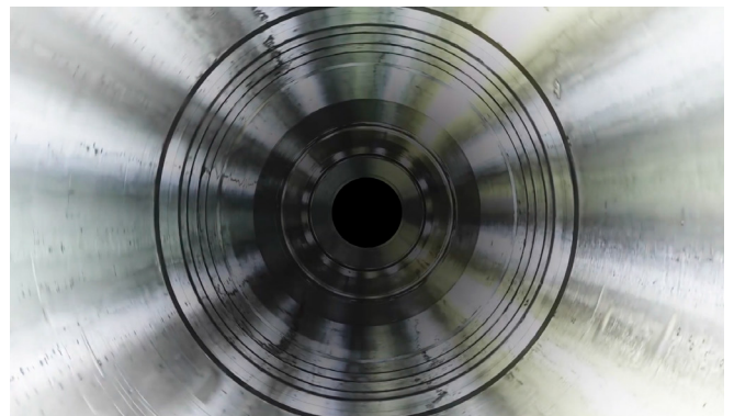
Figure 3: 3D fly-through visualization

Armed with the quantified information provided by ValveVA, the operator successfully performed a rig-less intervention to install a wireline retrievable safety valve, resulting in rapid restoration of safe production and avoidance of a costly workover.