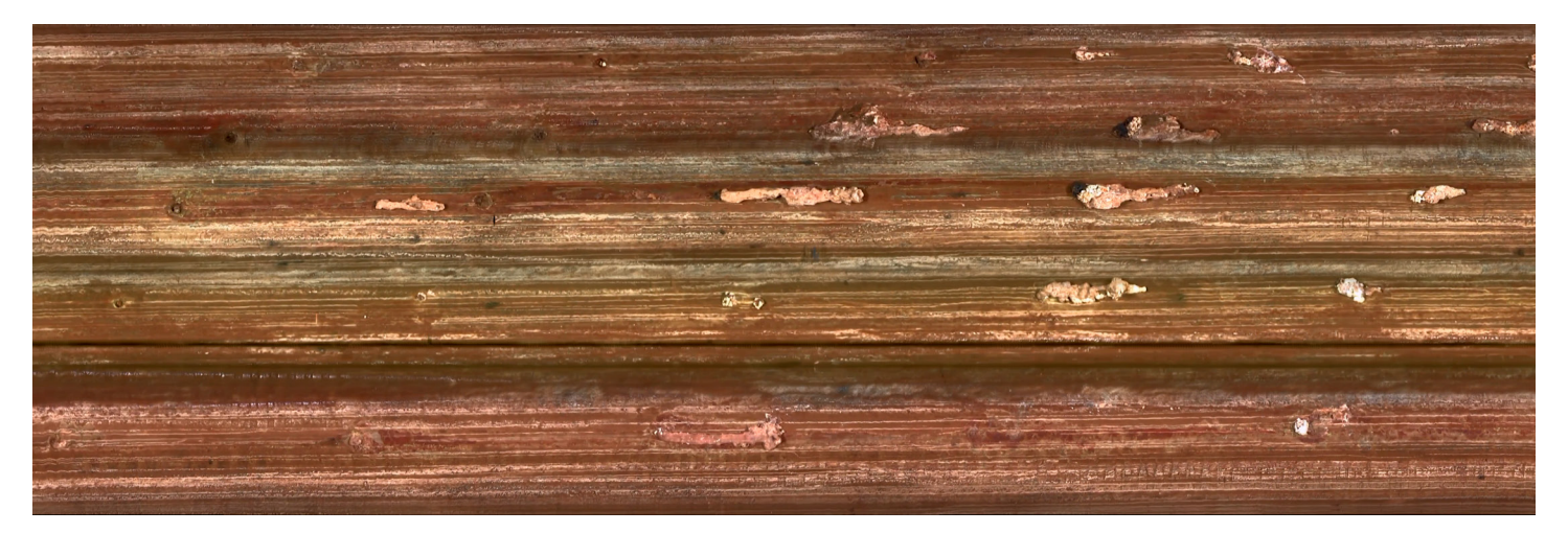
Figure 2: 360 degree mosaic image of plugged perforations