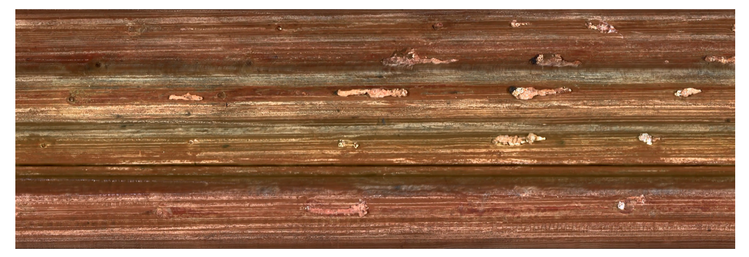
Figure 2: 360 degree mosaic image of plugged perforations