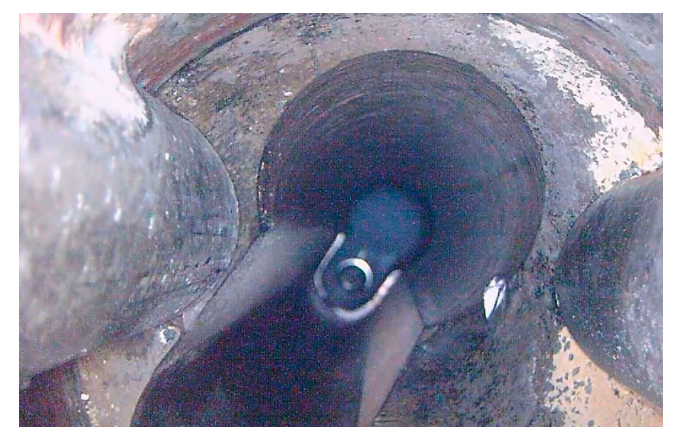
Figure 2: Impact damage identified from tool impact at SPM

As a result, the operator was able to move on to the next well in the sequence and maximize the efficiency of the campaign.