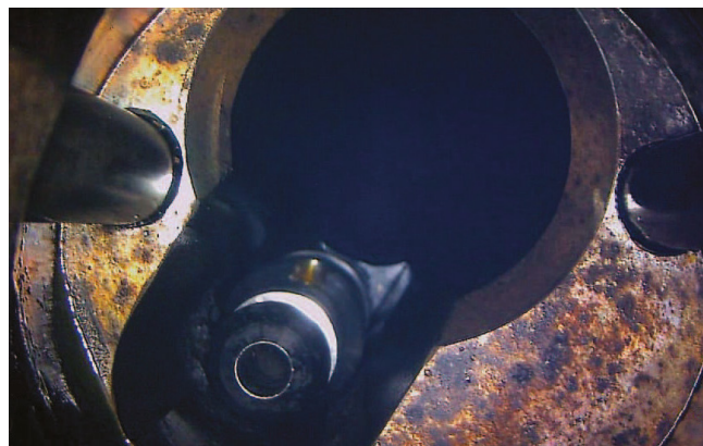
Figure 3: Condition and orientation of GLV and SPM (low-side)