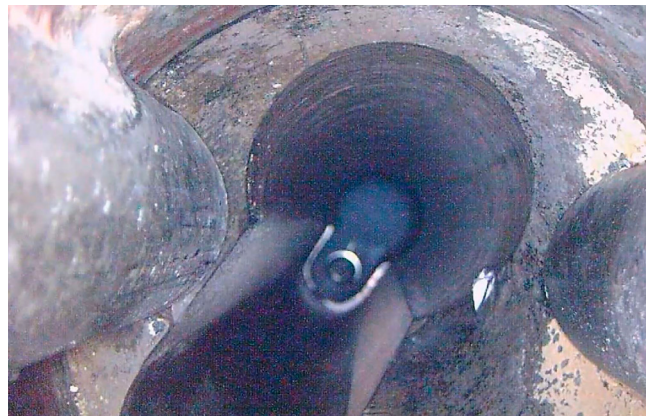
Figure 2: Impact damage identified from tool impact at SPM

As a result, the operator was able to move on to the next well in the sequence and maximize the efficiency of the campaign.